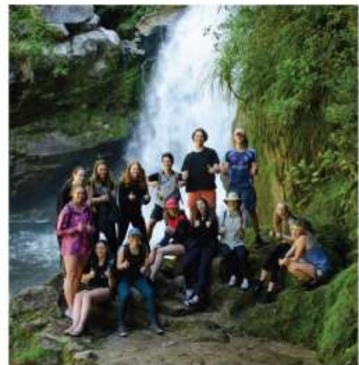
Students on the Adventure Skills Development Programme

Ngāti Koata Trust have partnered with us to deliver a series of leadership wānanga for Ngāti Koata rangatahi designed especially with and for whānau. The first wānanga is a Waka Ama Journey on 15-18th November designed to increase rangatahi self-confidence, cultural connection, and develop a strong sense of belonging to iwi and significant whenua. It is free for Ngāti Koata Rangatahi in Years 9 - 13 to attend. To apply head to ngatikoata.com .