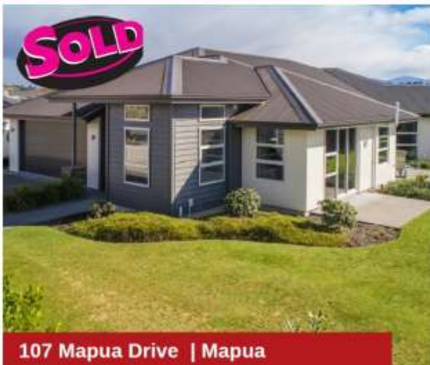
107 Mapua Drive | Mapua