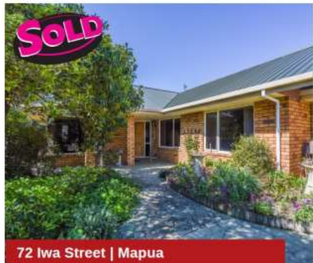
72 Iwa Street | Mapua

Adele Calteaux | 027 337 5848 | adele.calteaux@summit.co.nz