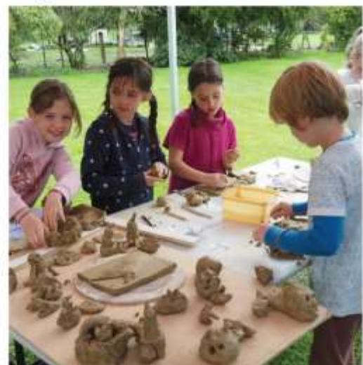
Having fun making nature clay creations on the Go Wild Holiday Programme