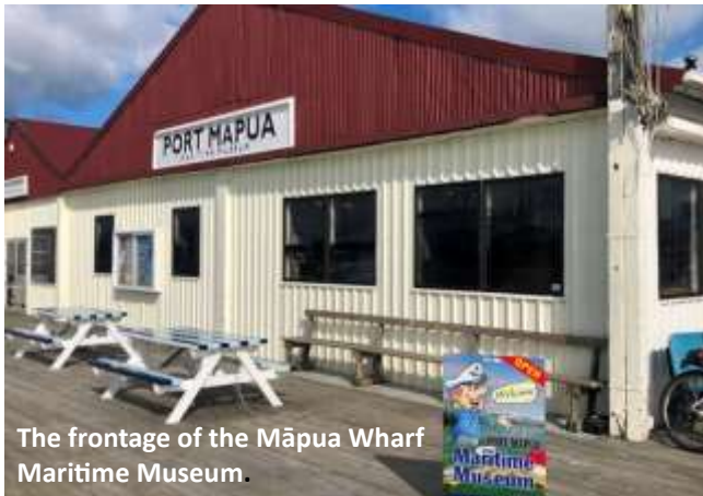
The frontage of the Māpua Wharf Maritime Museum.