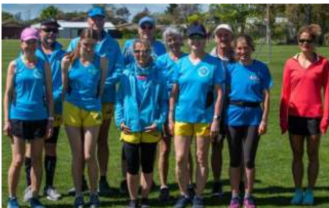
The group at the Māpua Sprig & Fern 10k

So, if you fancy having a go at walking or running the 5k please come along on a Thursday night. We meet at the Domain playground with walkers starting at 5:15 and runners at 5:30.