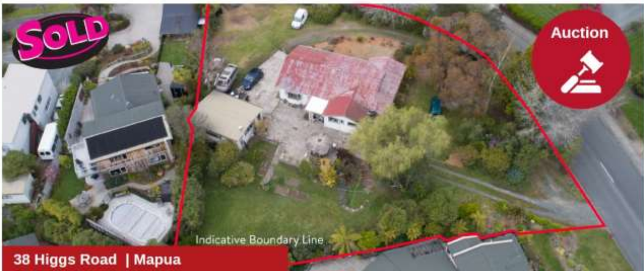
38 Higgs Road | Mapua