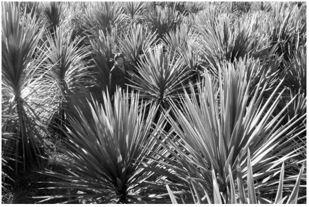
Mapua Wetland worker Karole Turner with cabbage trees in the Mapua Wetland. These trees planted as seedlings three years ago were amongst the earliest planted on the site.

The most impressive growth was from kahikatea trees. Of the tagged kahikatea trees that were measured, the maximum yearly growth was 70cm, with an even more impressive average growth rate of 56cm for 11 trees. More trees have been tagged for ongoing growth measurements.