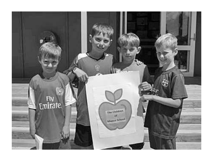
Mapua School's 2012 donation to the Mapua Hall restoration fund