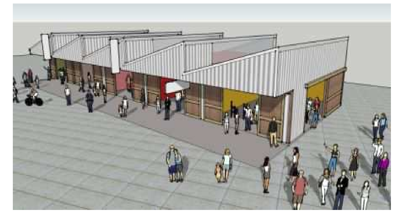
Pictured is a proposed use of the Mapua wharf site formerly occupied by the aquarium and other businesses. The proposal was considered by the Tasman District Council Engineering Services Committee in November.

Instalments arrive in your Inbox according to the schedule you set (e.g. 7am every weekday). You can read each instalment in less than five minutes and, if you have more time to read, you can receive additional instalments immediately on demand. Titles include bestselling and award winning titles, from literary fiction and romance to language learning and science fiction. You can browse either by Author, Titles or Categories to find something you like. The site also features forums where you can discuss your favourite books and authors.