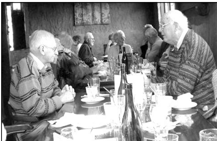
Members of the Mapua Friendship Group during the mid-year luncheon at Smugglers Café in Tahunanui enjoying camaraderie and delicious food.

Fridays: 10am-noon—Craft n Coffee—learn a craft & share a laugh! Open to all, crèche provided